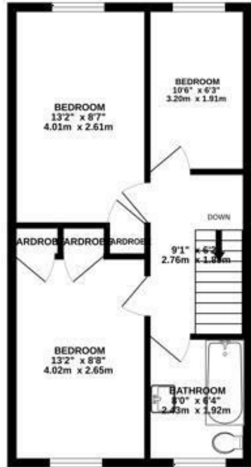
TOTAL FLOOR AREA: 851 sq.ft. (79.1 sq.m.) approx.

While every attempt has been made to ensure the accuracy of the floorplan contained here, measurements of doors, windows, rooms and any other items are approximate and no responsibility is taken for any error, omission or mis-statement. This plan is for illustrative purposes only and should be used as such by any prospective purchaser. The services, systems and appliances shown have not been tested and no guarantee as to their operability or efficiency can be given. Made with lettings 4/2025